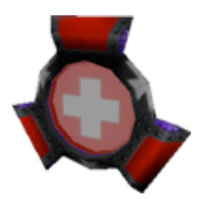
Health Powerup These will give you more health.