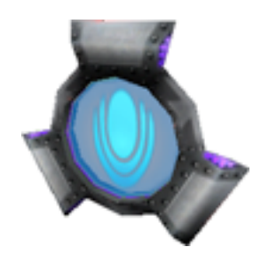
Fuel Powerus These will give you more jetpack fuel.