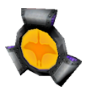
Free Life Powerup This will give you a free life