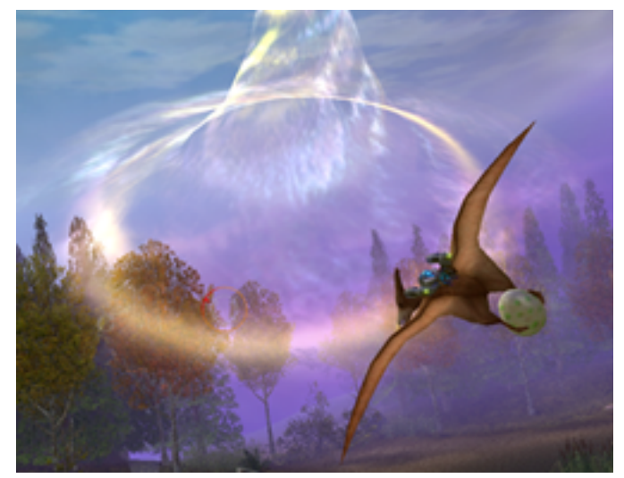
Fly near the wormhole to deposit eggs

Each time you send an egg back to Earth it will appear in the status bar at the top of the screen. The egg display will indicate how many eggs of each color are remaining and how many have been retrieved on the current level.