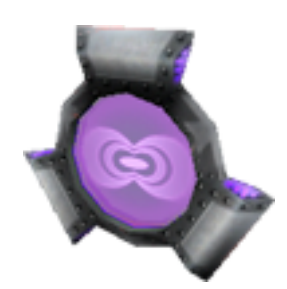
Shield Powerup These give you more shield power..